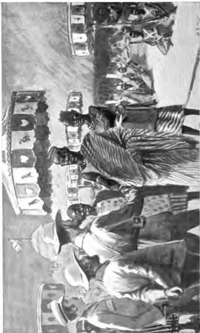
HURTON VISITS THE KING OF DAILOMÉ.