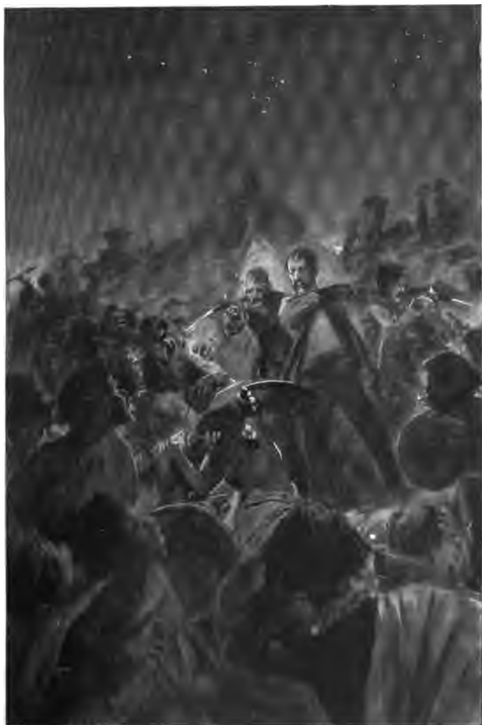
THE ATTACK ON THE CAMP AT BERBERA. [ See Page 96. ]