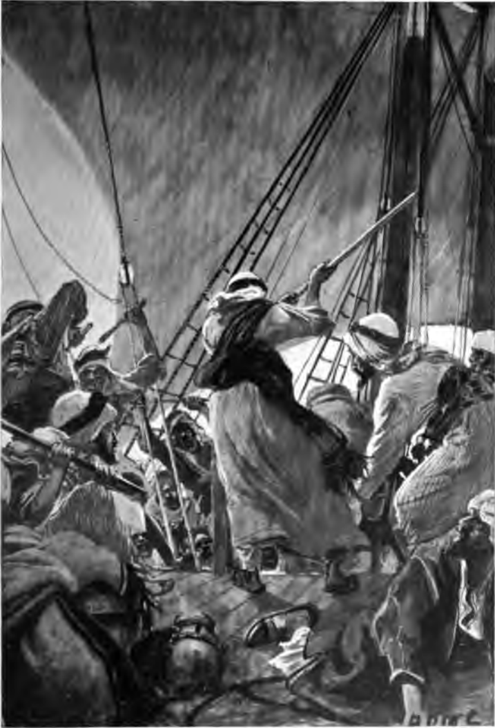
THE FIGHT ON THE SILK EL ZAHAB.