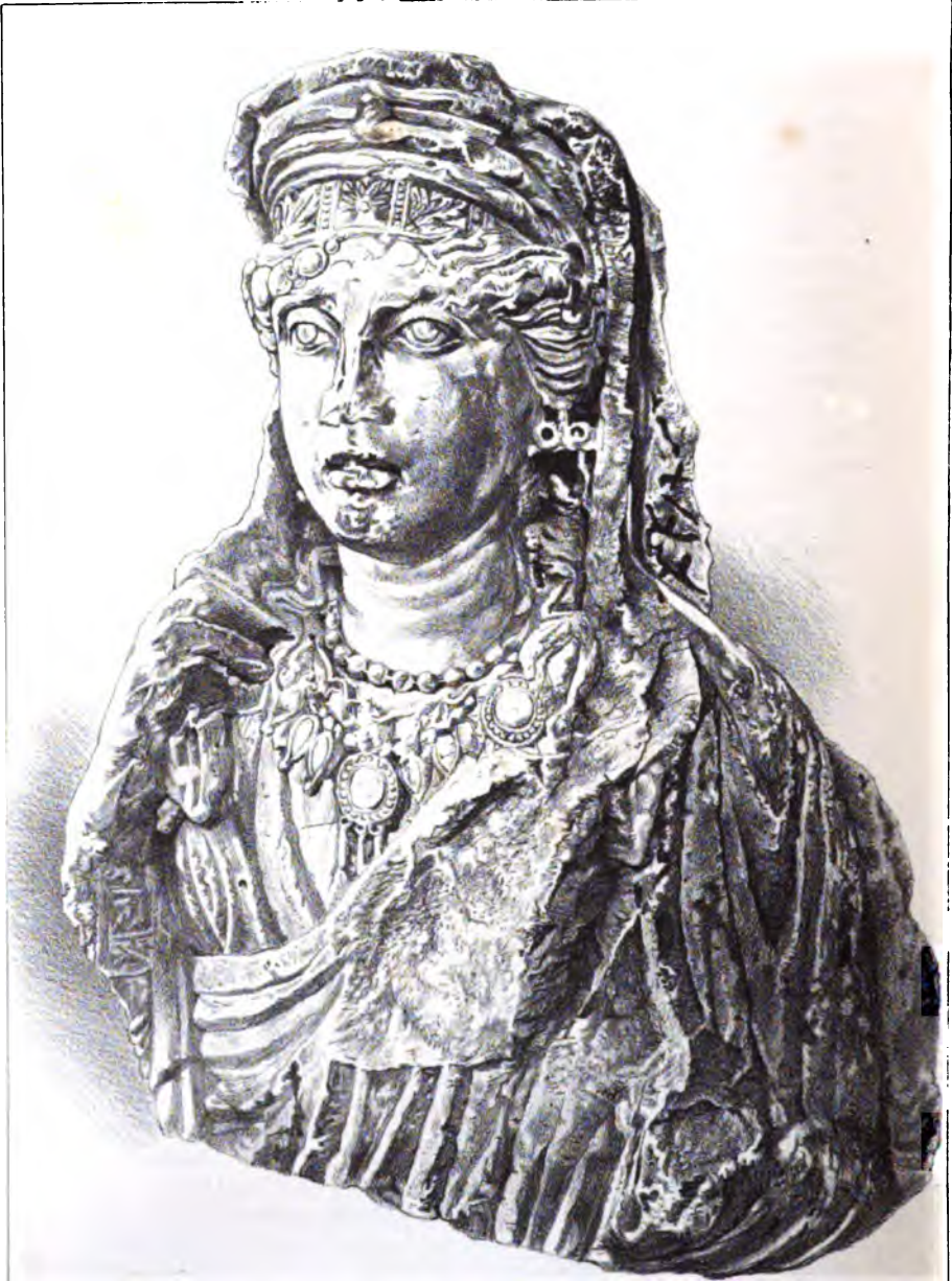
BUST OF ZENOBIA (?) in the collection of M. PERETIÉ OF BAYRUT.