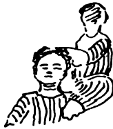
PALMYRENE MOTHER AND CHILD